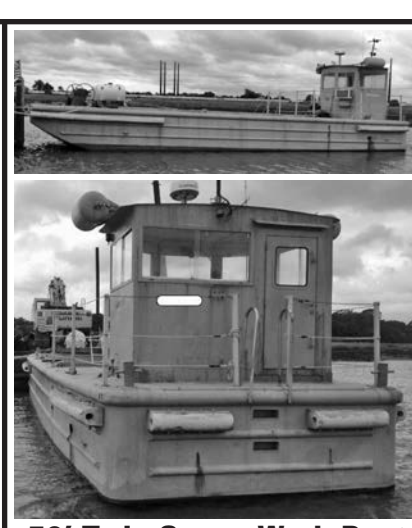
50' Twin Screw Work Boat (2) 671 Detroit Diesel engines (Low Hrs) Push knees on bow with (2) 10 Ton hand winches. 5 KW Generator (new 2014) AC in Main Cabin. Full Electronic w. Radar $52,500

Sale Price $10,000 Ea. $20,000 for the pair. Delivery Available in USA.