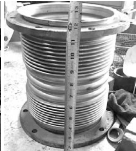
Exhaust Bellow For Cummins QSK Part #389756300 12" x 14" Double Wall Never Been Used