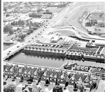
Fairbanks Morse Pumps at 17th Street Canal pumping station.

A large number of Hydraflo Hydraulic Pumps are included in the inventory of assets being developed for sale. These are currently located at the same sites as the above mentioned Patterson and Fairbanks Morse pumps, but will be made available for sale from the storage location (TBC) as they are decommissioned. 40 x 60" hydraulic pumps & 14 x 42" hydraulic pumps.