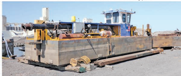
Dredging Supply 58 Ft 6 In. x 17 Ft 10 in. x 4 Ft – To be sold by photo