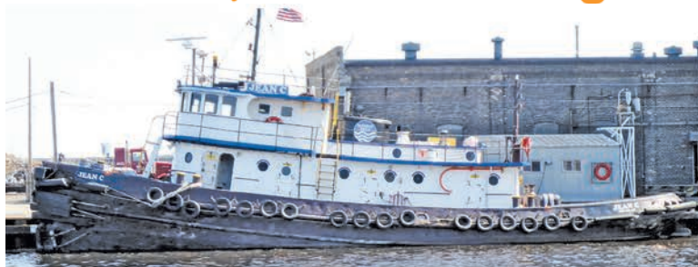
Equitable Equipment Co. Jean C 23 Ft x 77 Ft 1 In. x 10 Ft 3 In. ABS Certified To be sold by photo

Fast, flexible financing available – up to 100%, $0 down*