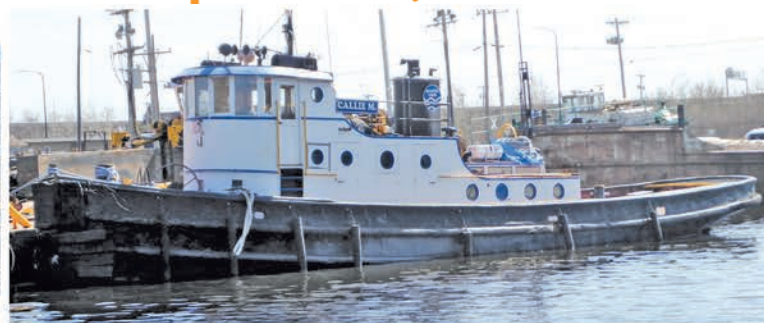
Lorian Callie M 16 Ft 9 In. x 64 x 8 Ft – To be sold by photo